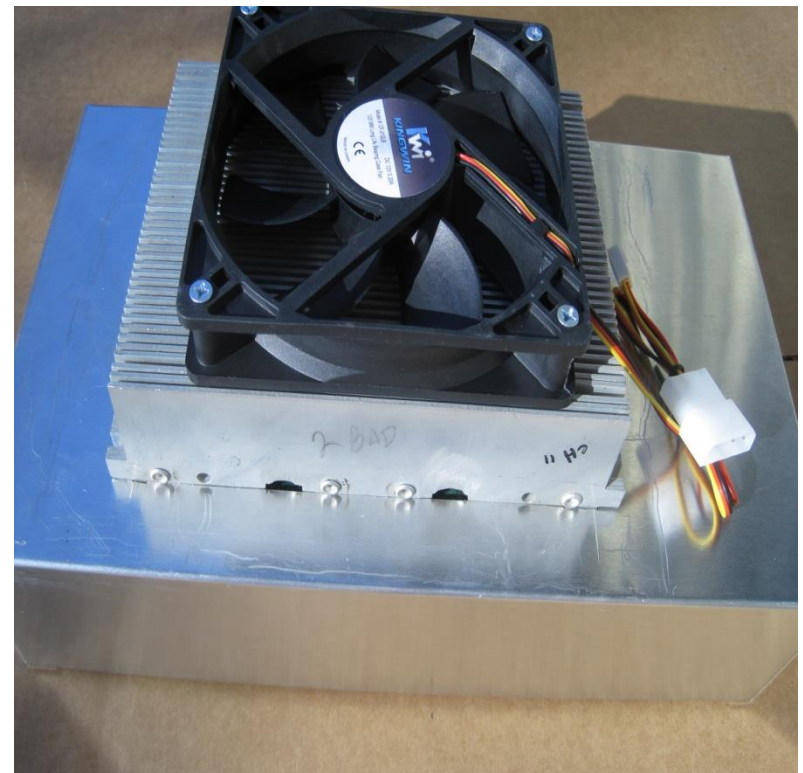
Fan mounted in place on the module heatsink