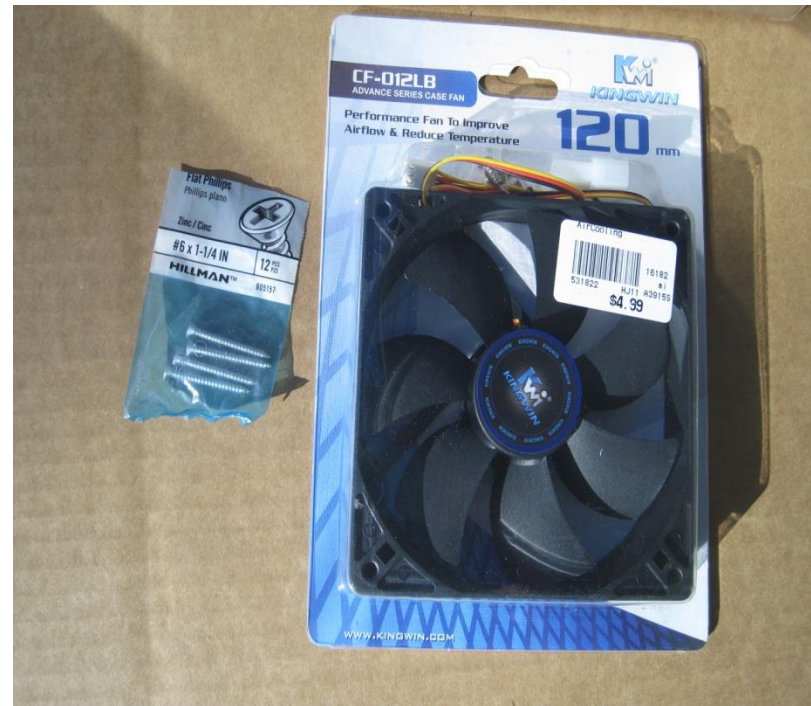
Computer case fan and sheet metal screws